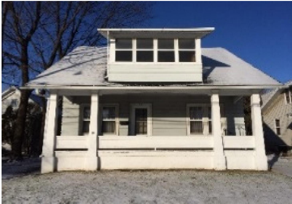
Long-term Supportive Housing Home