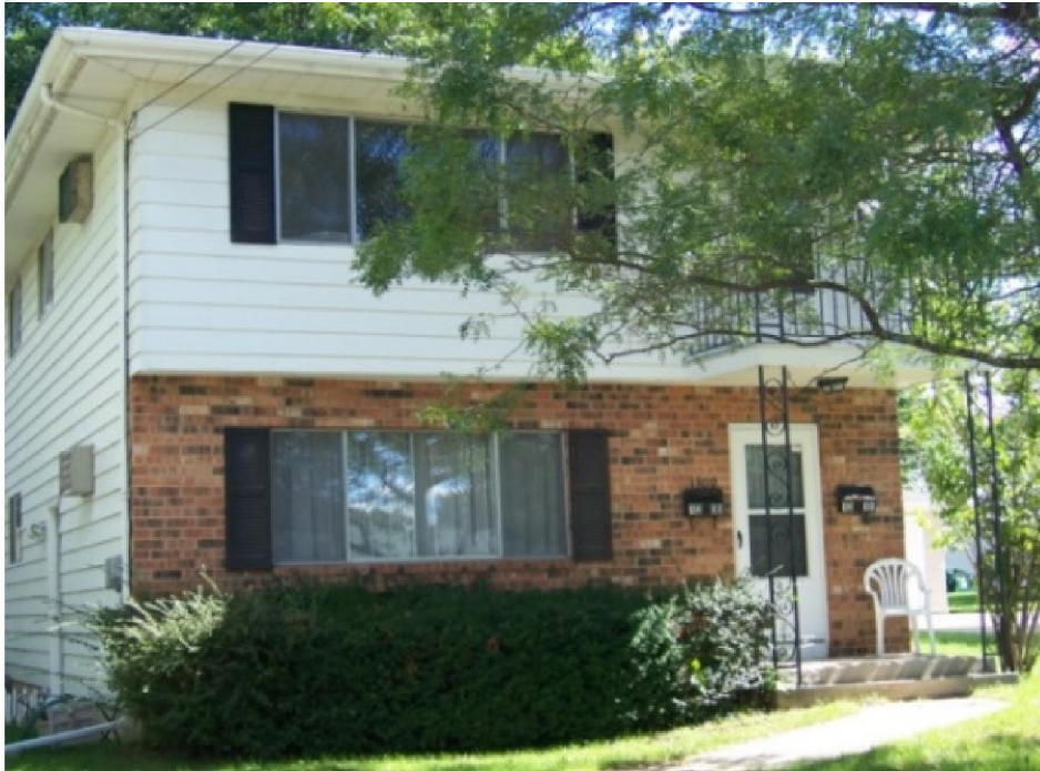
Transitional Housing Home